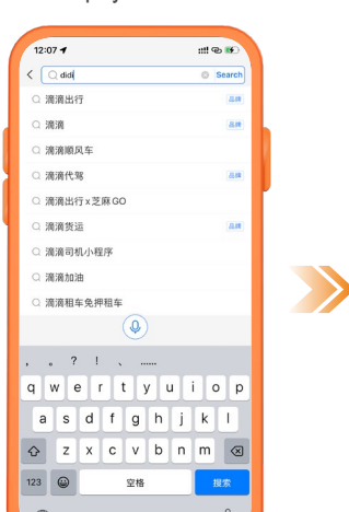
Step 1: Search "DiDi" in your Alipay or WeChat APP.