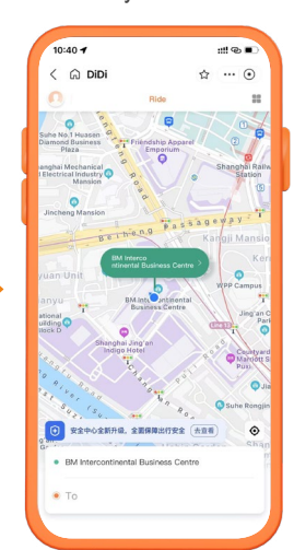
Step 2: Choose your location and your destination.